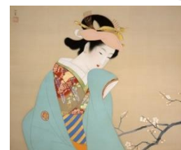
Uemura Shōen, Fragrance of Spring Yamatane Museum of Art

TEL: +81-(0)47-316-2772 (NTT Hello Dial, English available) URL: https://www.yamatane-museum.jp/