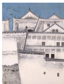
Okumura Togyū, Himeji Castle . Color on Paper, 1955; Yamatane Museum of Art