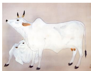
Okumura Togyū, Sacred Cattle . Color on Silk, 1953; Yamatane Museum of Art