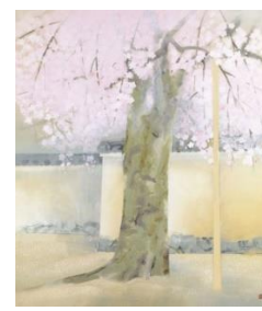
Okumura Togyū, Cherry Blossoms at Daigo-ji Temple . Color on Paper, 1972; Yamatane Museum of Art

Next Exhibition: Special Exhibition Commemorating the 55 th Anniversary of the Yamatane Museum of Art: