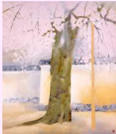
Cherry Blossoms at Daigo-ji Temple