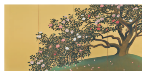
速水御舟 《名樹散椿》 【重要文化財】 Hayami Gyoshū Camellia Petals Scattering [Important Cultural Property]

ひとひらずつ散る五色の八重散椿を題材にした速水御舟の代表作《名樹散椿》。咲き誇る椿の花をかたどりました。(柚子あん) Smooth bean paste with yuzu citron flavor (Yuzu-an) ※葉は飾りです。お召し上がりの際はお外してください。