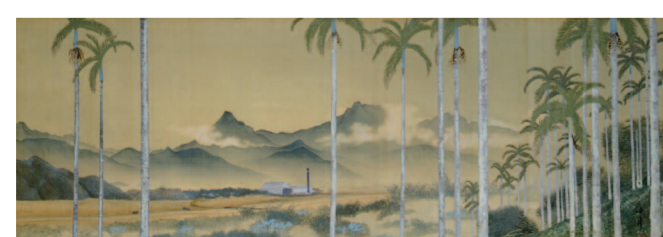
西郷孤月 《台湾風景》 Saigō Kogetsu Landscape in Taiwan

描かれた台湾の山々や手前に並ぶ檳榔の木をモチーフにしました。練切りに入った杏の風味もお楽しみいただけます。(杏入り練切り・こしあん) Smooth red bean paste with shredded apricots (Anzuiri-an)