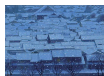
東山魁夷 《年暮る》 Higashiyama Kaii End of the Year

大晦日の京の町に降る雪。除夜の鐘が聞こえてきそうな魁夷の名作を和菓子で表しました。中は上質な黒糖を使った大島あんです。(黒糖風味大島あん) Smooth red bean paste with brown sugar (Kokutoiri-an)