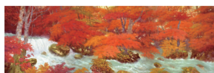
奥田元宋 《奥入瀬(秋)》 Okuda Gensō Oirase Ravine: Autumn

奥入瀬の溪流に紅葉が映える景色。溪流の透明感を錦玉羹で、色づく葉を淡雪羹で表現した季節感あふれる和菓子です。(錦玉羹・羊羹・淡雪羹) Transparent jelly confection with Aawayuki-kan (main ingredient: meringue) and Yokan (sweet red bean confection) ※卵を使用しています。 ⚠ It contains egg