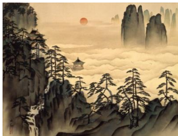
Yokoyama Taikan The Enchanted Mt. Penglai on the Island of Eternal Youth