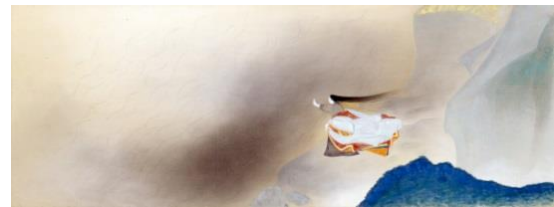
Kobayashi Kokei, Scenes from the Legend of Kiyohime: Hidaka River