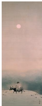
Hishida Shunsō, Cowherd in the Moonlight