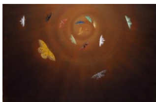
Hayami Gyoshū, Two Themes on Insect Life: Spider's Trap Beneath the Leaves and Moths Dancing Around the Light