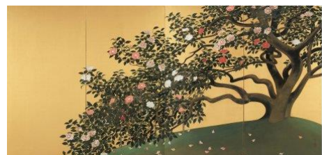
Hayami Gyoshū, Camellia Petals Scattering [Important Cultural Property] 10/16-11/11

Next Exhibition: Special Exhibition Art Associated with the Imperial Family — Nihonga Decorating the Imperial Palaces